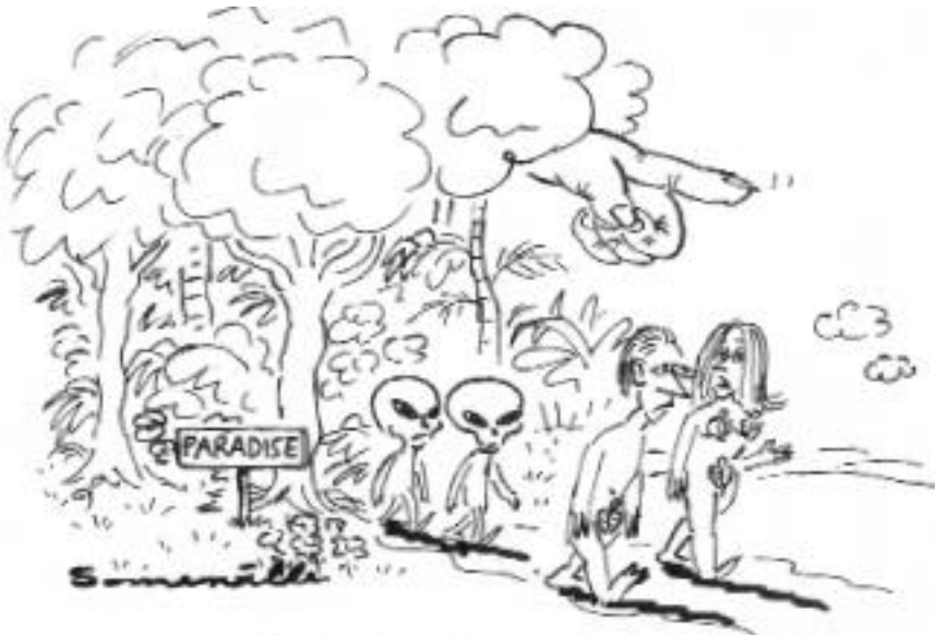
It's bad enough he's kicked us out, but the aliens as well?

(Source: New Scientist, August 31, 2001)